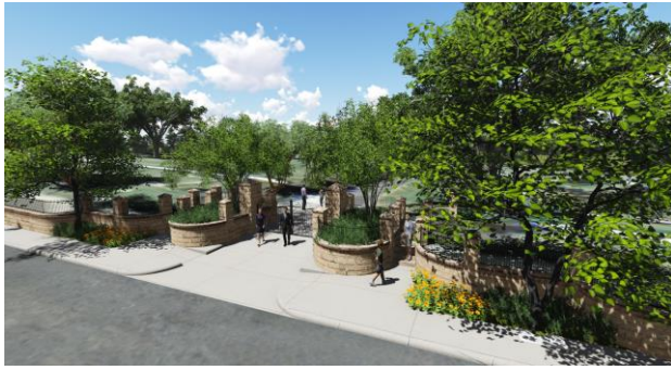
Front Gate Design